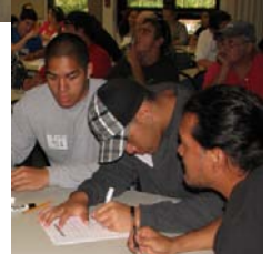
Above: Students quickly answering questions.