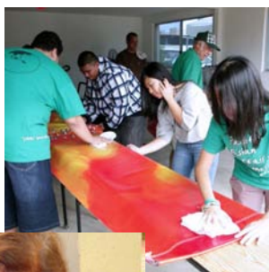
Campbell students also helped to make lanterns for Na Lei Aloha Foundation's Lantern Floating Festival.