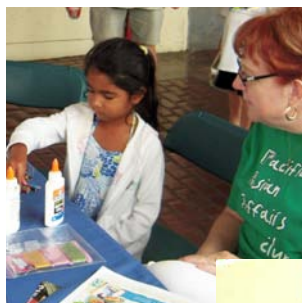
Students in PAAC's Campbell After-School Class and Club wrapped gifts and made crafts to raise funds to buy books for preschools in Vietnam.