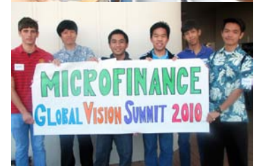
Top: Students shared their micro-lending experience. Above: Students from Damien High School.