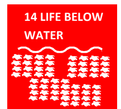
Too busy, sloppy, wrong color, wrong font