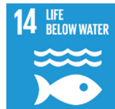
Original design for SDG #14

For more information about the UN Sustainable Development Goals, visit: http://www.un.org/sustainabledevelopment/sustainable-development-goals/