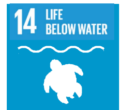
Example of Hawai'i-themed design