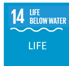
Lacking creativity, not Hawai'i related