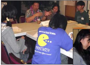
Above: Students talking with career guests about their professions. Right: Students mapping how far their food travels to Hawai'i.

Did you know that Hawai'i produces only 15% of our own food supply? Or, that as recently as the 1960s, 50% of our food supply came from local sources? Over 200