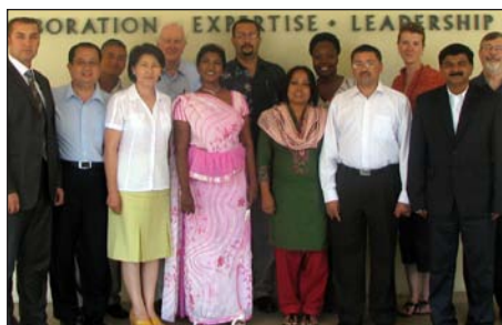
Crisis management group from Central and East Asia, and the Pacific.