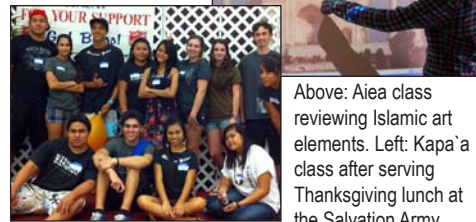
Above: Aiea class reviewing Islamic art elements. Left: Kapa`a class after serving Thanksgiving lunch at the Salvation Army.