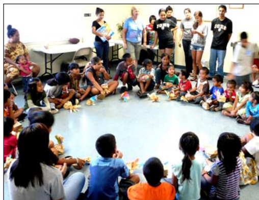
Students from Campbell after-school class playing games with children at Onemalu Homeless Shelter.

After-School Global Studies classes were held at eight high schools during the fall semester. Curriculum units included world hunger, food security, and Islamic civilization and art. Students also attended Secretary Hillary Clinton's talk on America's Engagement in the Asia-Pacific (see page 3), participated in the International Zero Emissions Conference Youth Day at the Hawai'i Convention Center, and toured Shangri La to see real life examples of Islamic art concepts. During the semester, students carried out Global Action Projects, community service projects related to their units of study. The Campbell High class continued an on-going project working with Onemalu Homeless Shelter in Kapolei. Funded by Youth Service Hawai'i, students planned and implemented literacy and art projects twice a month for children at the shelter. Their Thanksgiving visit focused on gratitude. Aiea High students joined the Campbell class at the shelter. Radford and Roosevelt High classes volunteered with the Special Olympics organizing various activities for their holiday event. Kaimuki students did a beach clean-up with Surfrider Foundation. The Kapa'a High class has an on-going project with the Food Bank on Kaua'i. They work on Saturdays at the mall to help collect canned goods and other donations. For more photos, see page 4.