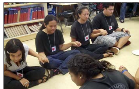
Students experience unearned privilege through an exercise, "Fair Play."