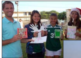
Left: Aiea students assisting with Christmas party at Onemalu Homeless Shelter.