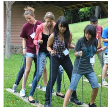
Students have to communicate and work as a team to move forward.

Orientation sessions throughout the week focused on Vietnamese history, language, and society, as well as practical considerations for traveling and our itinerary. Students learned about Vietnam's fascinating history, unique culture, and contemporary challenges. Speakers from the University of Hawaii and the Vietnamese Student Association shared their expertise with the group. Speakers' profiles and the orientation schedule are included in this report. Student presentations were another major component of orientation week. Topics included folklore, education, art, and religion.