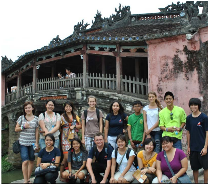
Participants at the historic Japanese Bridge in Hoi An

One student expressed the group's sentiment: "Originally I had wanted to go to Japan. I didn't really have any reason to want to go to Vietnam. But (after orientation), I think I would rather go to Vietnam... Since I was expecting to go to Japan, it's a totally unexpected experience, almost designed to test my acceptance of trying a new thing that is totally out of the blue."