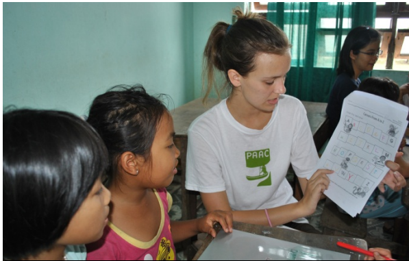
Working with students at An Bang school

In Hoi An, we donated our fundraiser money to three schools. We provided classroom books for a preschool, where we spent one morning singing and playing with the students; we painted a mural for an English language school; and we also made a special presentation of two computers and notebooks and pens for the student body at An Bang elementary school, where we spent a morning teaching English and art. It was very gratifying to know that we made an impact in this community. We also had the chance to spend time with a local family and local college students.