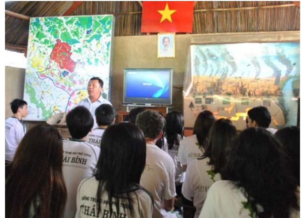
PAAC and Thai Binh student visit the Cu Chi Tunnels together

“The students were really fun to dance with and all of their dances were awesome. It’s kind of hard to think that all these kids are under a communist government. I think that even though the government is communist, people just enjoy the freedoms they have. For example, there are all these posters on the telephone poles that say ‘Ramus.’ I asked our tour guide what Ramus means. He said that is a shampoo company on a government poster, and that no one cares about the government’s poster.”