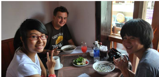
Eating pho for breakfast in Sapa town

“I have to say that I strongly feel that the people in Hanoi are the kindest people that you could possibly meet. All our home stay partners were so awesome mainly because they welcomed us with open arms and wanted to get to know us all on the very first day.”