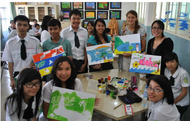
PAAC students attend art class at Thai Binh with their partners.

“Vietnam’s youth want the same things that all kids want. They want all the newest things and they want to do better than their parents... All of the kids I have met have been hard-working and warm. If the country is going to be led by kids like them, I am confident in Vietnam’s future.”