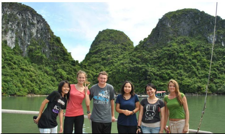
Enjoying the spectacular scenery aboard the boat in Halong Bay

“A natural phenomenon, Halong Bay was our last stop in northern Vietnam. The majestic limestone islands were thought to be created due to a legend of a mother dragon. To prevent Vietnam from being taken over by foreign invaders through the sea route, the people looked to a deity; the mother dragon and her sons were chosen to fly into the bay, which brought up pearls that became the islands. To this day, there are 1900+ landmasses in Halong Bay, and they are recognized as a World Heritage Site for aesthetics, biodiversity, and geomorphology.”