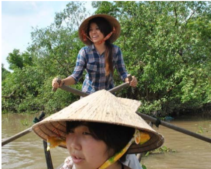
Paddling around the Mekong Delta

Our next destination was the Mekong Delta. We experienced the warm hospitality of the south through our host families and the other locals who shared their way of life with us: navigating the narrow waterways on sampans, making confections from scratch, and playing musical instruments.