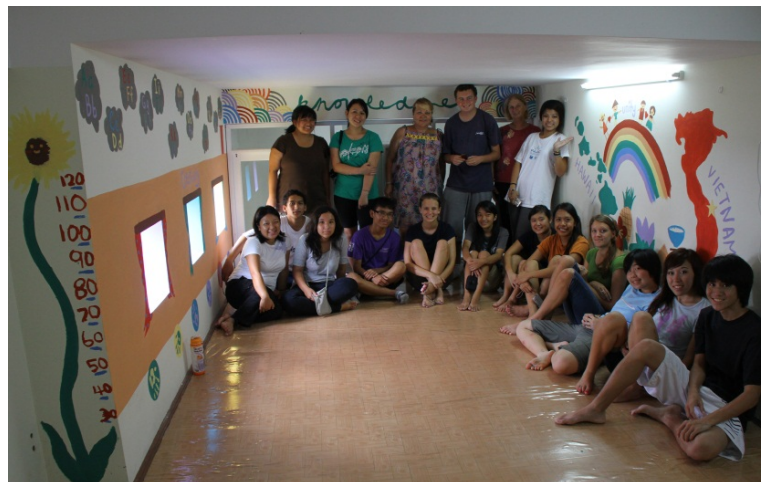
Showing off the murals we designed & painted in one morning

“I have been inspired to help out in my community more. I like knowing I can place smiles or hope on people's faces. Although I am just one person, I learned that I have the power to make a difference in someone's life.”