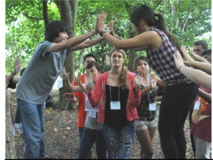
Partners build trust while spotters keep them safe.

“When I think of Vietnam now... I think of the market packed streets in the city, or the dragon-like spine of Halong Bay, or the rice fields... It’s pretty interesting how my view of Vietnam has changed over the past few days. When I think of how the people are like, I think of... a trampoline. The people as a whole are always getting pressed back, by China, then China again, then France, then the U.S. But they’ve always bounced back to secure their freedom.”