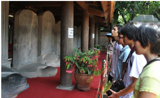
Stone tablets at the Temple of Literature bear the names of those who passed the grueling mandarin exams at Vietnam’s first university.