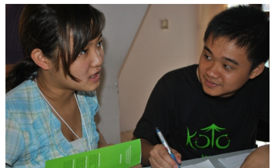
Learning Vietnamese phrases from a student at KOTO.

“KOTO, standing for ‘Know One, Teach One, is a non-profit organization with a goal to provide street children or those who are poverty-stricken with an education and starting a career. We visited a class of KOTO students, who were learning English but ironically helped us to