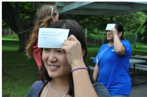
Students break the ice by learning "little-known facts" about each other.

"At first I thought it was just a fun game, but... when we were discussing the game I found out it was about cultures... The game showed me that when you are so used to your culture, it is hard to be a part of another culture because you think your culture is right... It taught me that I should not expect that they would do the same things I would and that their traditions are different. I should just go with the flow."