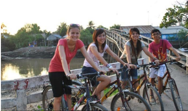
Exploring our neighborhood by bicycle at sunset

“Just like Hawaii, some people (in the Mekong Delta) depend on tourists to make a living... it reminds me of my dad’s work situation. If people... destroy Hawaii’s beauty, there wouldn’t be as many tourists coming to Hawaii, which would cut my dad’s salary since he works in a hotel.”