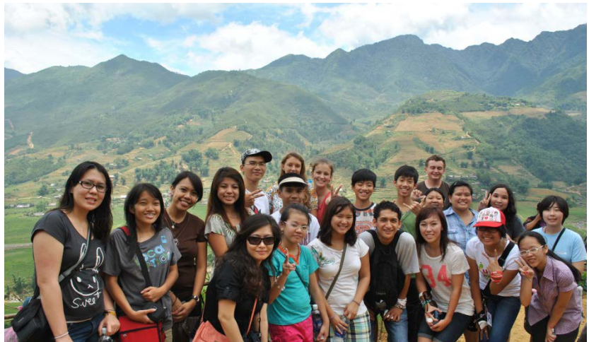
Hanoi and Hawaii students take a break from trekking in Sapa.

“The first night in Sapa, I was really homesick. All I could do was think about how dirty everything was. The second day in Sapa, however, was one of the best days for me. Planting trees and running down by the river was amazing. After doing fun things in Sapa, like climbing down into the rice fields, I started focusing on the potential of different things instead of focusing on the negative side.