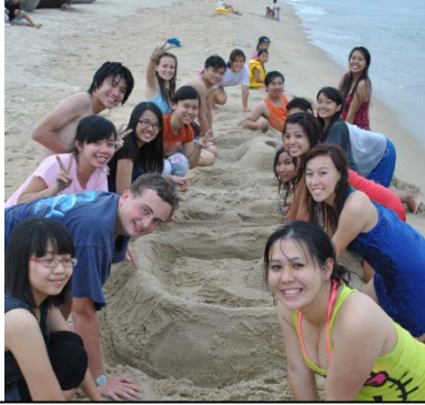
Evening at the beach in Hoi An