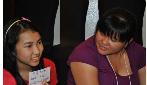
Students from Hanoi and Hawaii get to know each other

“I found out that I had the traits- wanting to travel and learn other cultures and languages- in common (with our presenters at the Embassy). I was really amazed and (our visit) made me think about going into this job.”